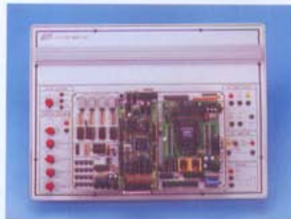
CI-500 DSP Standard Version