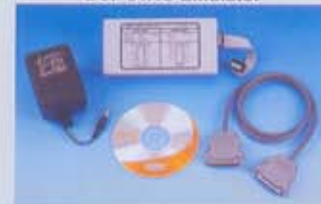
SN-510PP DSP JTAG Emulator

CIC-500 is a DSP development system designed for learning DSP hardware implementations. The system combines both DSP chip for signal processing and FPGA chip for I/O control. With various built-in I/Os and several implementation examples, ranging from basic DSP theory to advanced DSP applications, users are able to learn DSP implementations efficiently.